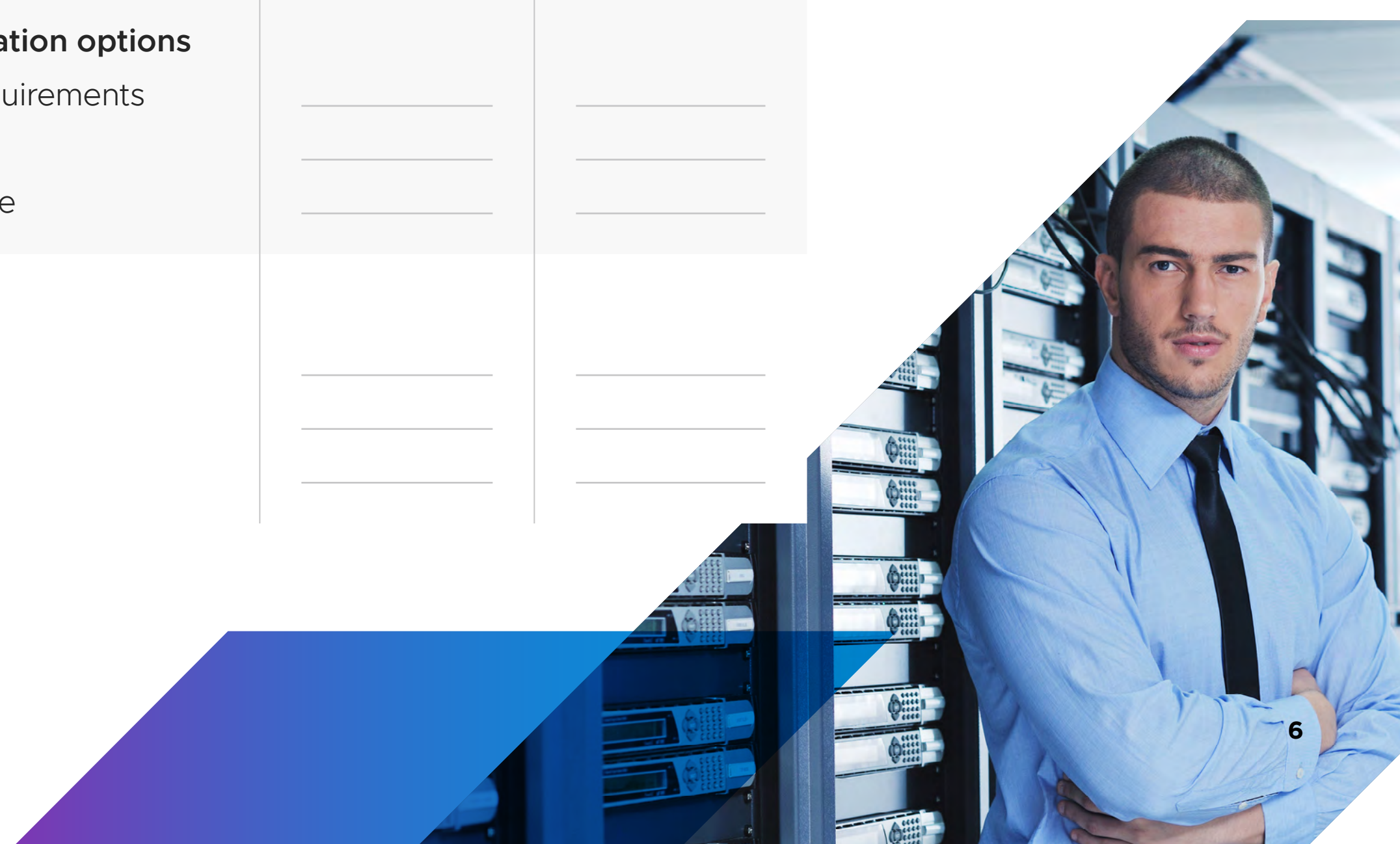
TABLE 1: Hybrid Cloud Use Cases